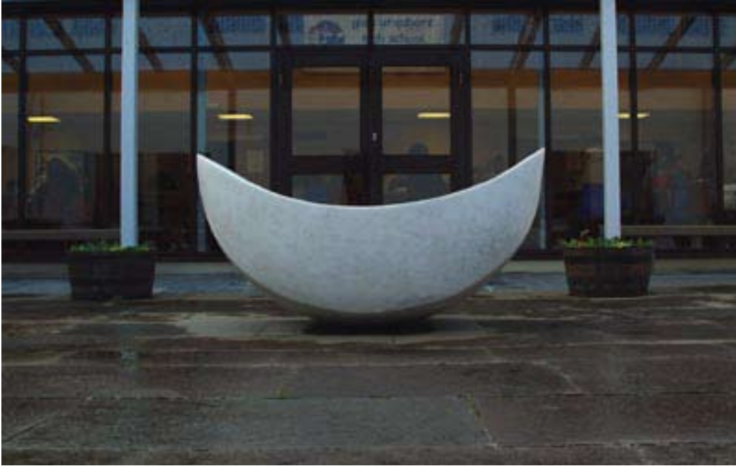
Bowl Glen Urquhart School 2004