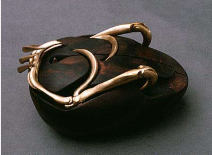
Hooded Crow/Twins 2005

If a wren flies into your chest then this is an omen of death. This throwing object can be cast into our internal landscape.