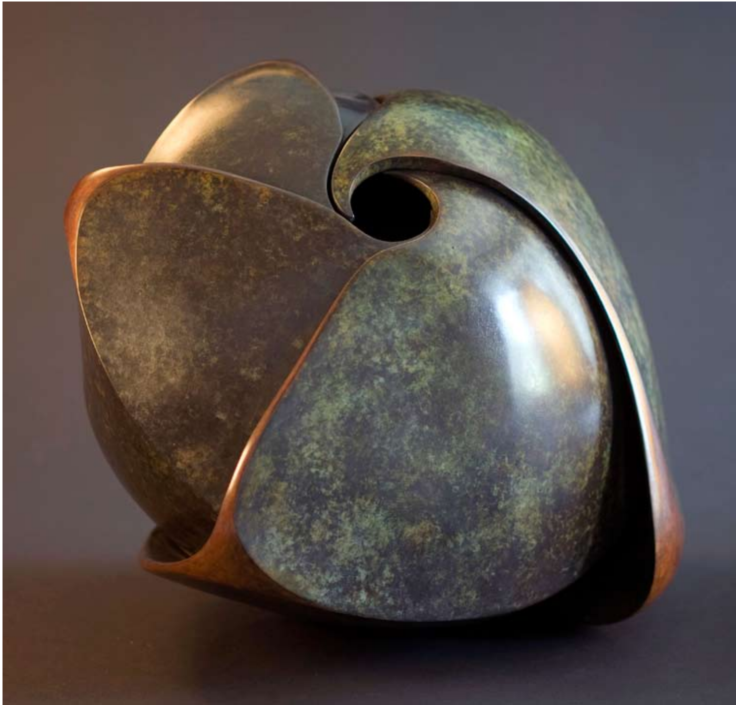
Evolution 2 2006

A more complex form in bronze, slowly evolving.